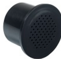
Active charcoal filter - FILTRE1 It's recommended to change it every years.

*Capacity given as an indication with 75cl Bordeaux traditional type bottles and measured with 4 shelves. Adding shelves reduce considerably the total capacity.